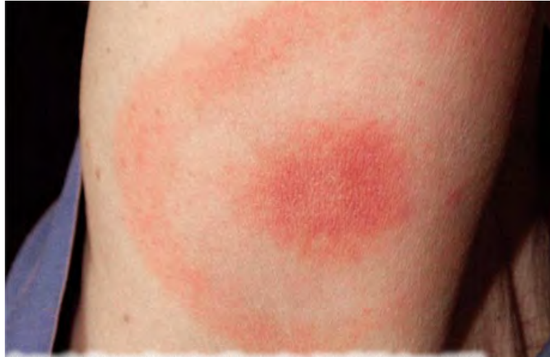
22 Centers for Disease Control and Prevention, http://phil.cdc.gov/phil/

The study calls for developing a vaccine prototype and defining host immune responses triggered by that prototype under different regimens, including different doses, number of immunizations, and types of immune-stimulants, and thereby identify how to prevent bacterial colonization and manifestation of the disease. Dr. Yi-Pin Lin of the Wadworth Center explained that the study builds on their strengths in identifying Lyme disease bacterial proteins as vaccine candidates and in investing how vaccine candidates block tick-to-human transmission of the Lymecausing bacteria.