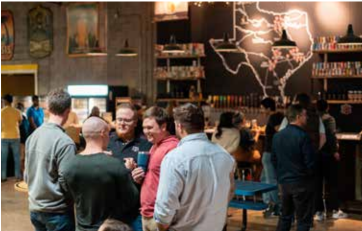
Bird Creek Burger Co. in Temple

TEMPLE IS REGARDED AS ONE OF THE GREATEST PLACES TO LIVE AND WORK IN TEXAS.