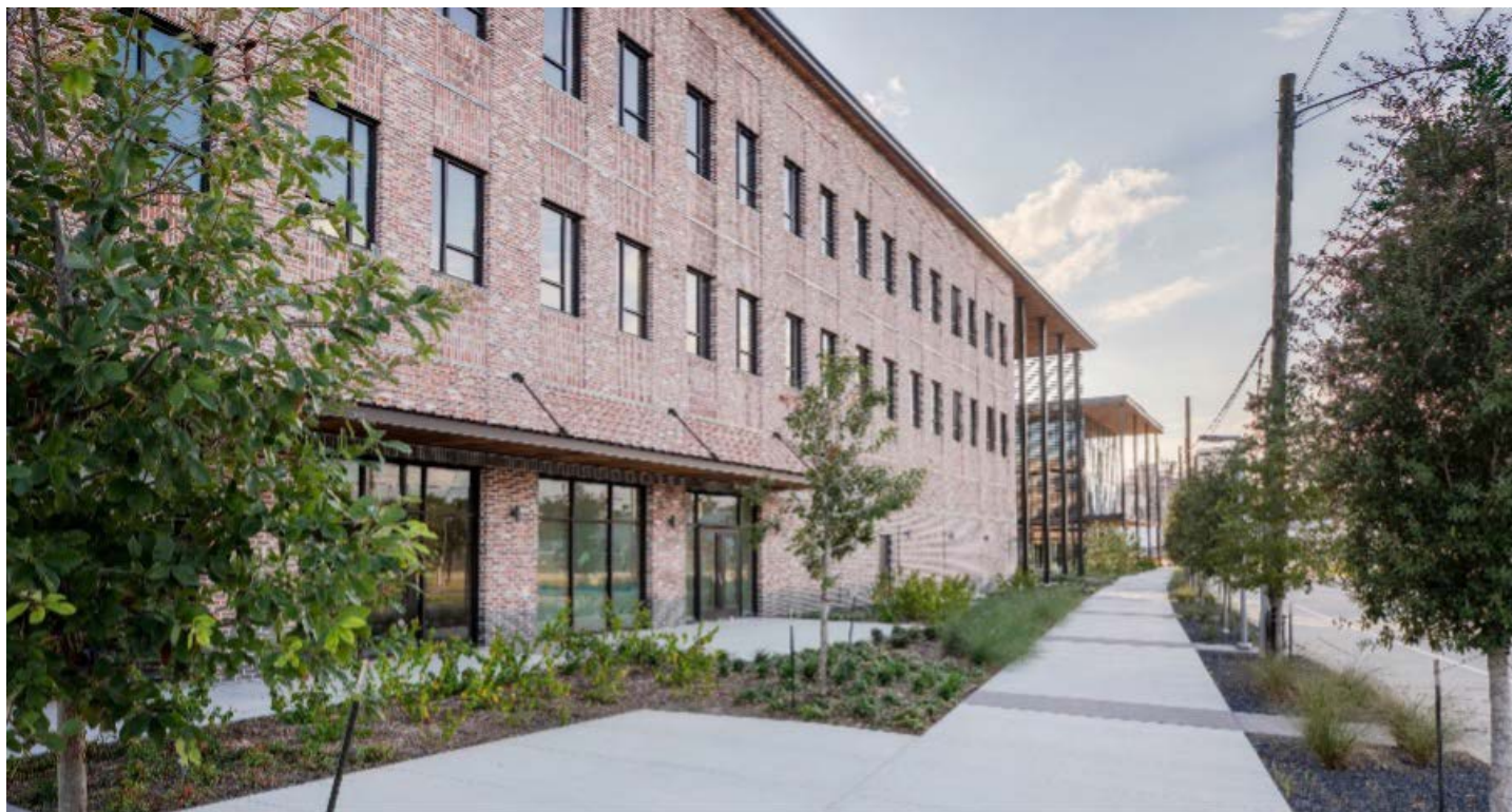
The Center for Pursuit