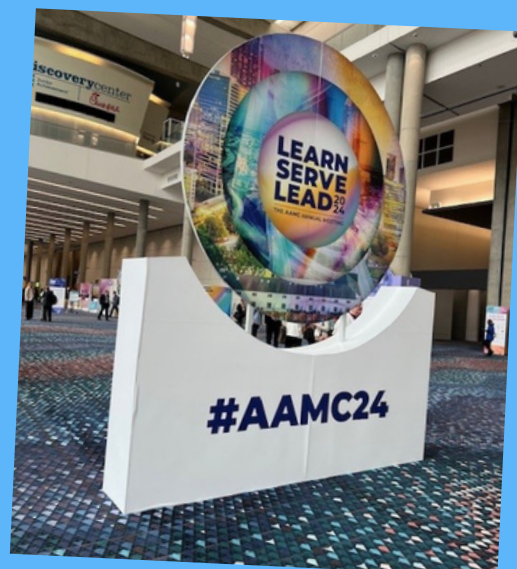
AAMC Conference in Atlanta, GA.