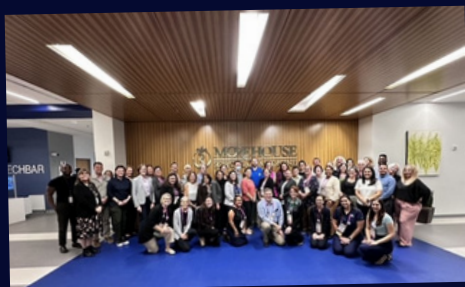
APQI Meeting with other Accreditation Professionals in Atlanta, GA.