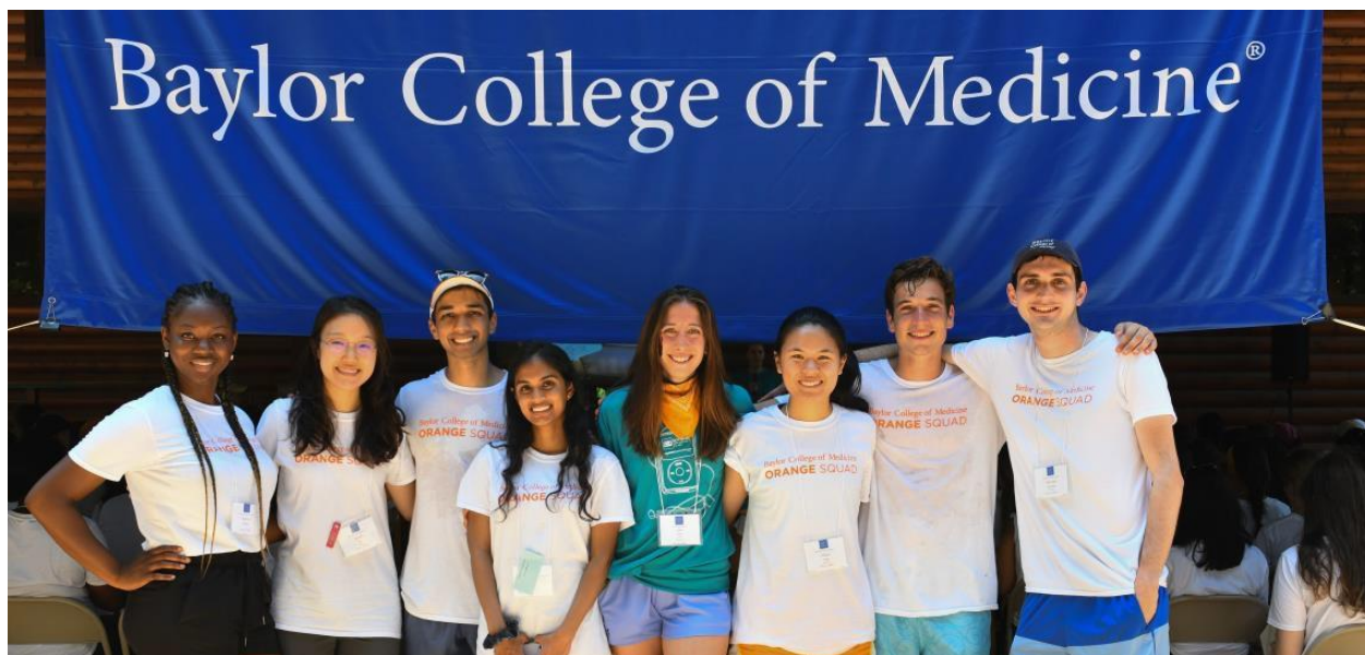
PRN Orientation Retreat