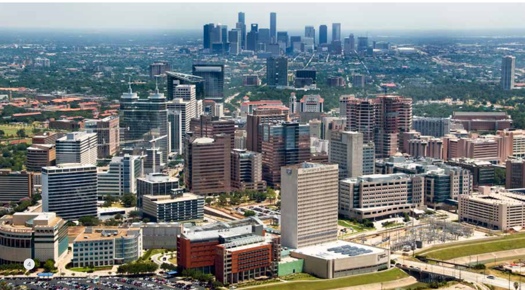
Texas Medical Center (TMC) with the downtown Houston skyline in the background. ▼

100% of Baylor students pass the first time they take the test, compared to the 97% national rate.