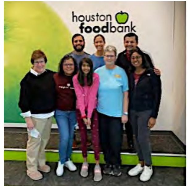
Houston Food Bank