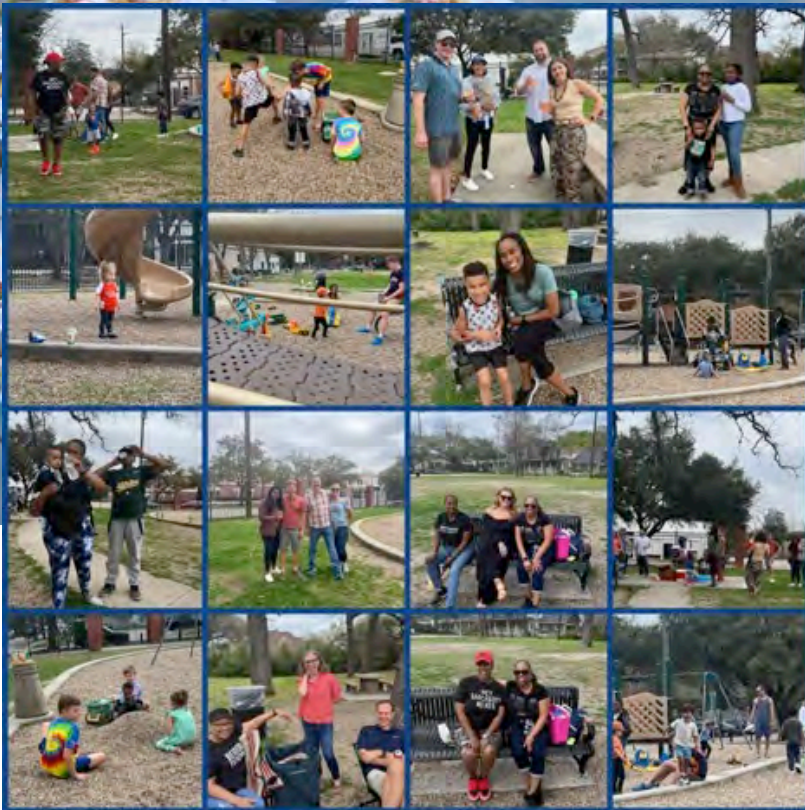
PEM Family Picnic