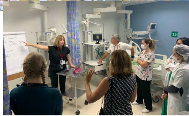
Debriefing after "just-in-time" simulation