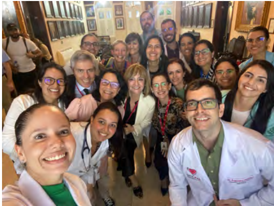
TCH and Real Hospital Portugues

Texas Children's Hospital Heart Center's International and Global Health Program is honored to be a volunteer partner program to Children's HeartLink (CHL) in the fight for a brighter future for children and families affected with cardiac disease around the world. CHL is a renowned NGO with more than 50 years of history saving children's lives by transforming heart care in underserved parts of the world. CHL works in six countries building sustainable cardiac programs, and ultimately, helping them become Centers of Excellence.