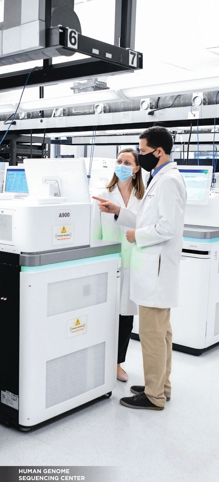
HUMAN GENOME SEQUENCING CENTER

The Partnership for Baylor College of Medicine is a giving society comprised of a dedicated group of supporters who advocate for Baylor. As part of this group, you demonstrate a deep commitment to the College's work by actively helping us power the future of health.